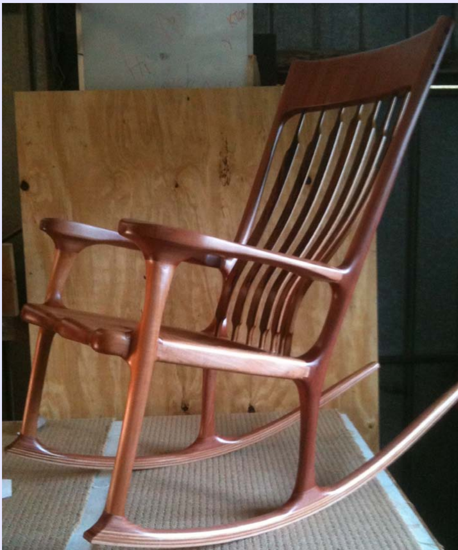
People's Choice Winner

You might like to begin planning an object to exhibit. We are looking forward to a bigger and better exhibition in 2011, so start your projects now.