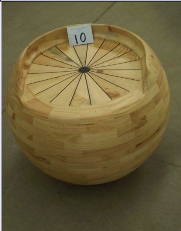
Pine Tub Chair Marday Ennassee