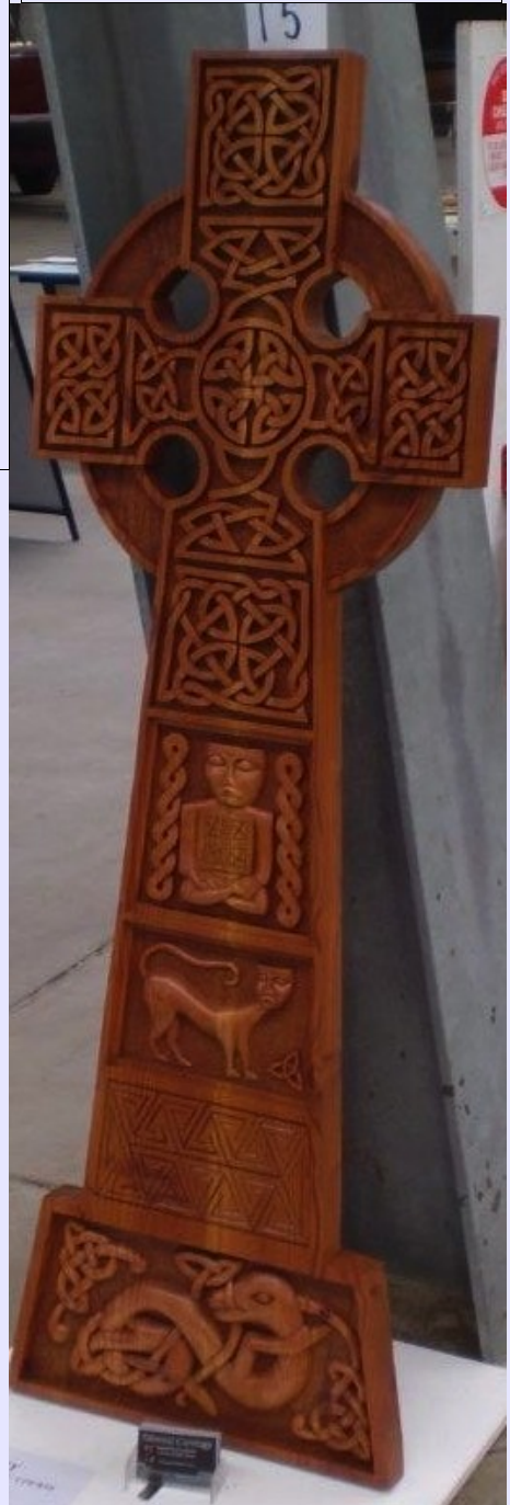
Celtic Cross Ronnie Sexton