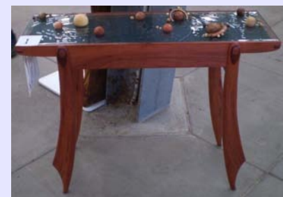
Hall Table Rod Jones