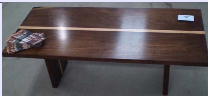
Walnut Coffee Table Warwick