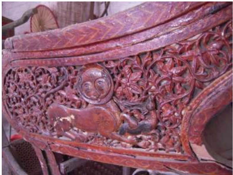
Decorative carving to the side of the palanquin.

Contemporary India has joined the modern world in its race toward technological and financial wealth, and the Maharajas with diminishing power and status are opening their once regal homes to tourists as a way of ensuring income for their descendants and not letting their era's importance fade into obscurity.