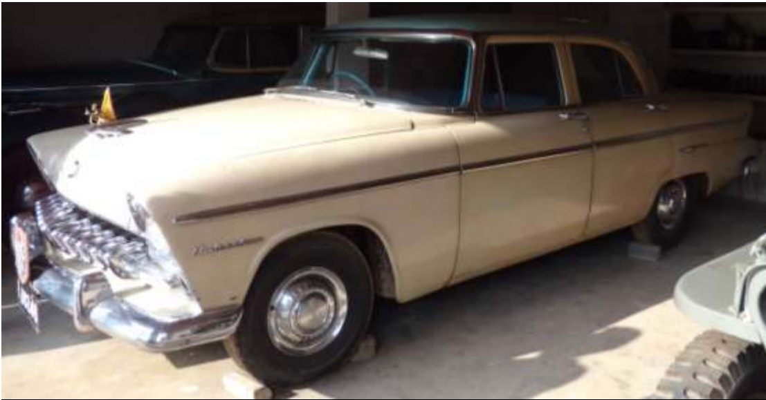
A 50's Classic in its original state.

through the generations; stuffed tigers behind the reception room couch, trophy heads of animals now hunted to near extinction, room after room fitted with magnificent furniture and walls covered in painted portraits of generations past sporting magnificent moustaches and turbans, all standing to attention in prim and proper order, looking both powerful and elegant.