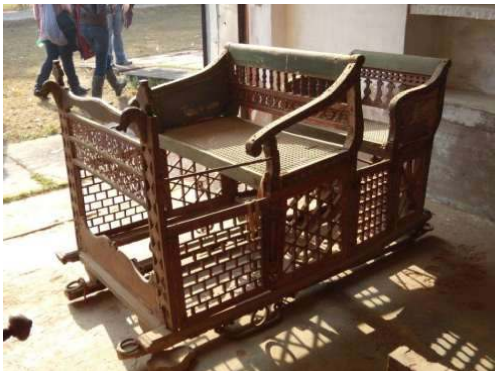
The howdah with its beautifully crafted lattice work and cane seating.

This was just the main building. Out in the backyard (as we would call it) behind the orchards and to the side of the fish farm, all covering acres, was a row of garages filled with beautiful old cars, cannons, farming equipment and howdahs. |