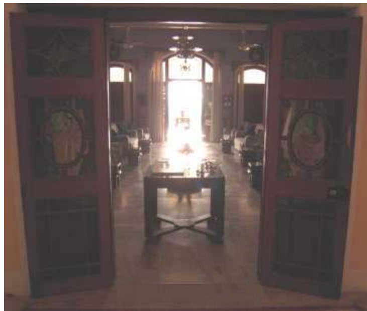
Palace Entry Hall

Complete with family possessions passed down