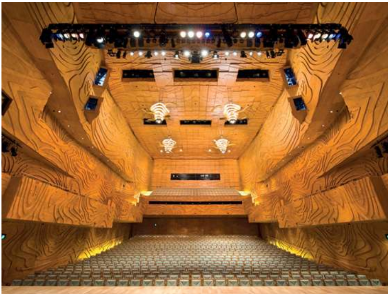
ARM Architects. Elisabeth Murdoch Hall.