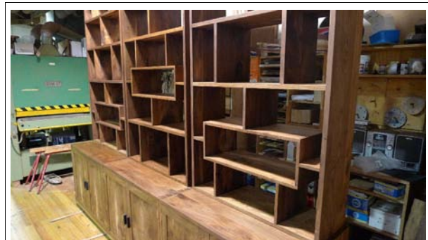
Shelves near completion