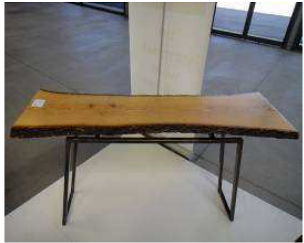
Table by Nat Patane