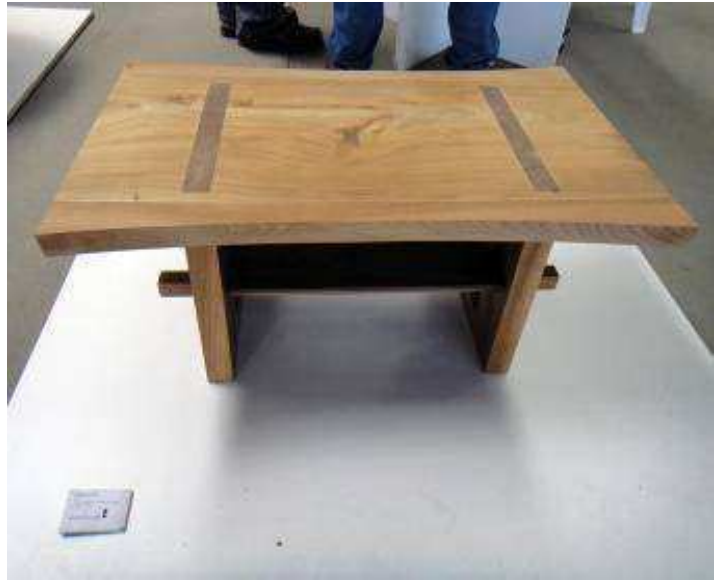
Low table in elm by Russell Davidson.