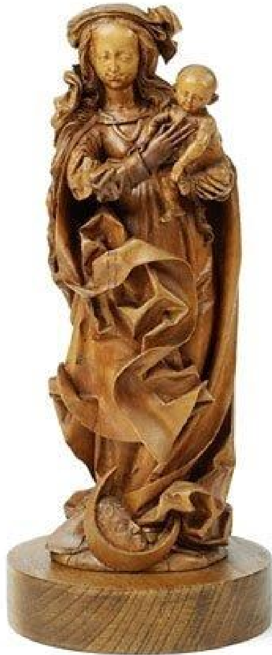
Virgin and Child, about 1500-1505, Height 20.3 x 7 x 6 cm. Victoria & Albert Museum.

No doubt there are works attributed to him that may well be products of his workshop assistants, as was the way of the time; however, there are also intricate finely carved pieces that are evidence of this great master carver's skill that cannot be ignored – grand or small.